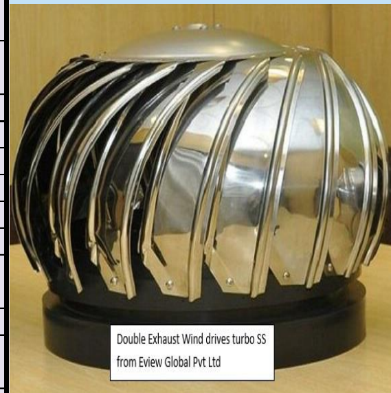
Double Exhaust Wind drives turbo SS from Eview Global Pvt Ltd